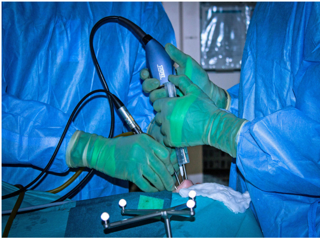
Figure 3 Endoscopic four-hands technique with two surgeons working together. One uses both hands to dissect, the other controls the endoscope and keeps the surgical field clear. Instrument manipulation must be well-coordinated between the surgeons.