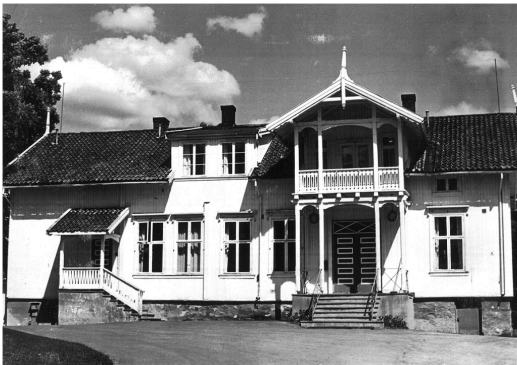
Figure 2 Solberg farm. The farmhouse has been demolished and replaced by a laboratory building. This picture was taken around 1965.

Patients from all over the country were referred to Solberg farm. Approximately 80 % of the admissions were funded by public authorities, mainly by local poor relief agencies. The remaining 20 % were paid for by the patients' relatives. Sometimes the willingness to pay was low, and perhaps also the ability. The following is written about one patient who was admitted from February 1913 until August 1914: 'His father wanted to take him home. Unable to pay for him in this time of high costs.' About another patient who was admitted for six months in 1914, it says: 'Moved back home to his mother, since Larvik poor relief fund no longer wanted to pay for him.'