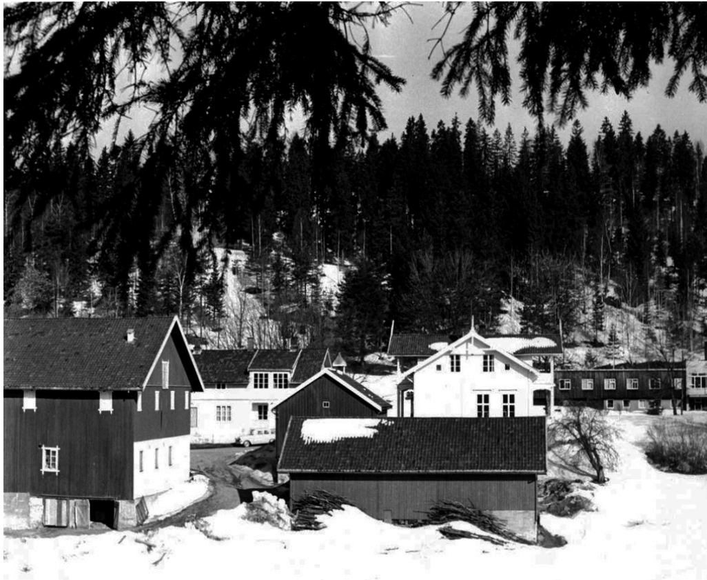
Figure 5 The epilepsy centre at Solberg farm in Bærum in the 1960s.

jurisdiction. The centre is Norway's only hospital for patients with severe, uncontrolled epilepsy. With its history, it is a monument to the rapid development in epilepsy care that has taken place during the last century.