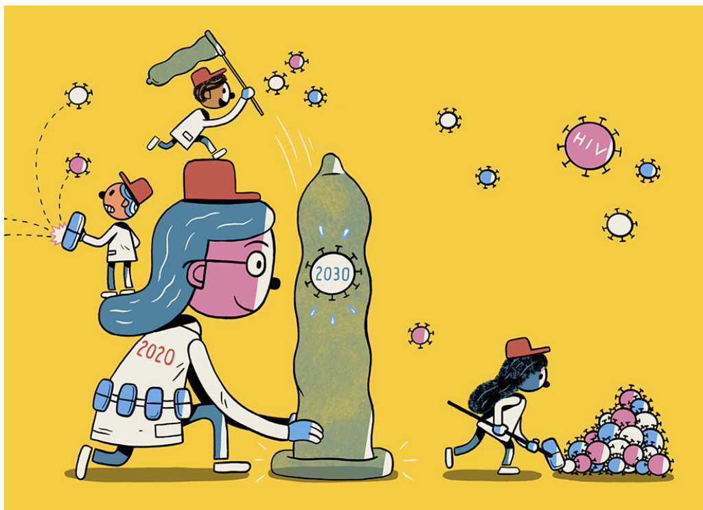
Illustration: Eivind Gulliksen / desillustret

One of the targets of the UN Sustainable Development Goals is to end the HIV/AIDS epidemic by 2030. The first milestone, the '90–90–90 treatment targets', is supposed to be achieved this year. We believe Norway has reached these targets.