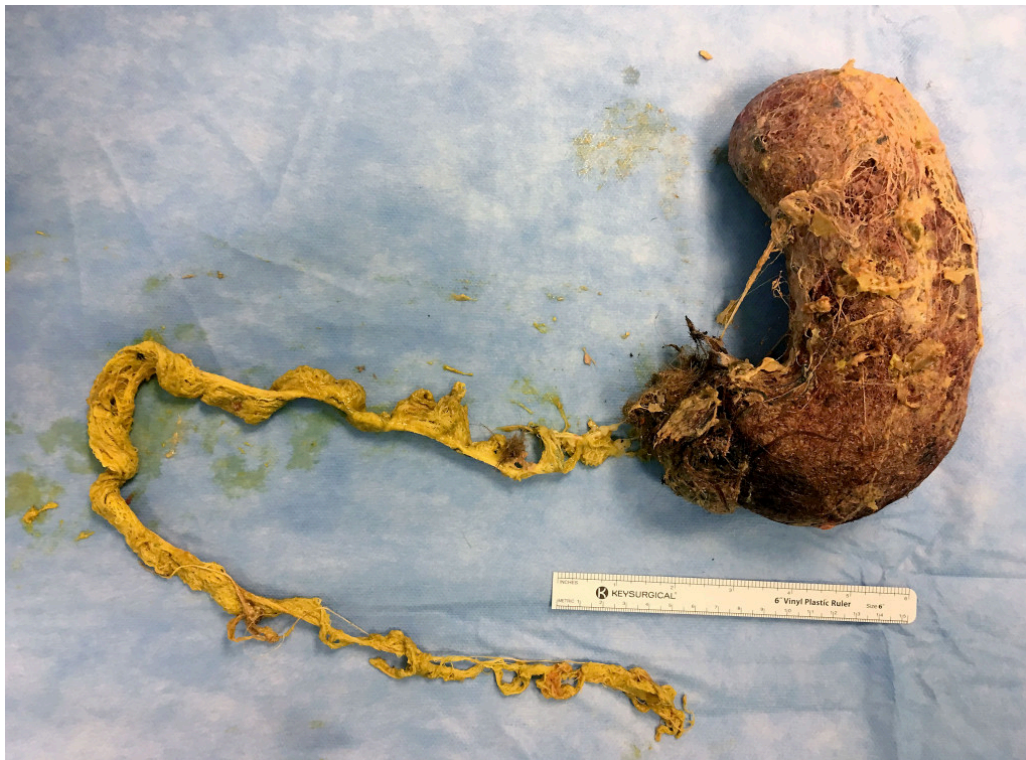
Figure 2 The trichobezoar shaped like the stomach, with an extension about 60 cm long