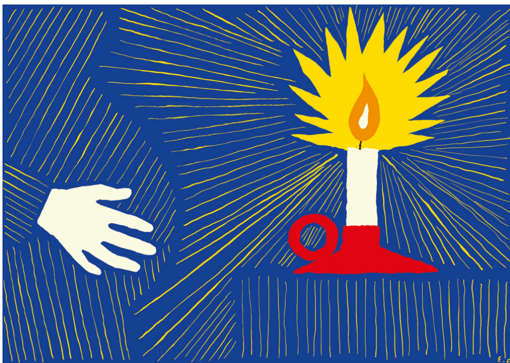
Illustration: Espen Friberg

Valproate came on the market in France in 1967. It is one of the most effective drugs for treating generalised epilepsy, bipolar disorder and migraine. As these are common conditions in women of reproductive age, valproate has been the third most used antiepileptic drug in pregnant women in the Nordic countries for the last 10–20 years.