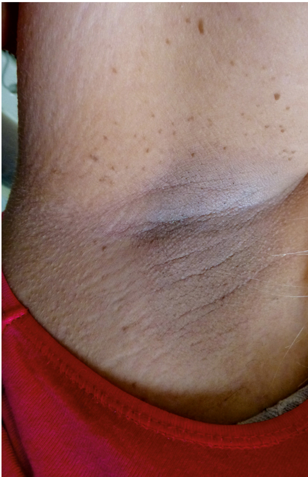
Figure 1 The patient had hyperpigmentation and freckles in her armpits.

One diagnosis we considered was Fanconi anaemia. This disease classically presents in childhood with bone marrow failure combined with typical clinical findings, particularly skeletal anomalies of the thumb or radius and microcephaly (4). This did not fit our patient. Short stature, café-au-lait macules and freckles in the armpits can be seen with Fanconi anaemia, but are also typical of neurofibromatosis type 1, as is relative macrocephaly. However, neurofibromatosis type 1 could not explain the bone marrow failure, and sequencing (cDNA-based) of the NF1 gene associated with this condition was