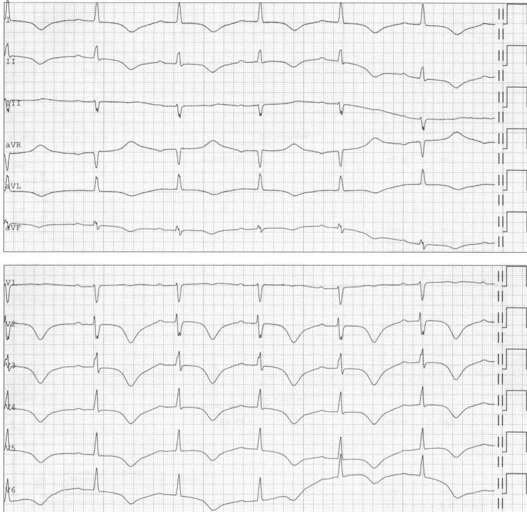
Figure 3 ECG from day 11 showing sinus rhythm but new-onset T-wave inversion in standard leads I, II, aVL and aVF and in precordial leads V2–6. Corrected QT interval 590 ms.

On day 11, the woman again became increasingly dyspnoeic, but without accompanying chest pain. Auscultation revealed crackles over both lungs upon inspiration. ECG showed sinus rhythm, QRS width 97 ms, corrected QT interval 590 ms and a new-onset T-wave inversion in precordial leads V2–6 in addition to standard leads I, II, aVL and aVF (Figure 3). Over the course of the day, she had repeated episodes of rapid atrial fibrillation that were treated with beta blockers. Loop diuretics were administered owing to clinical signs of heart failure.