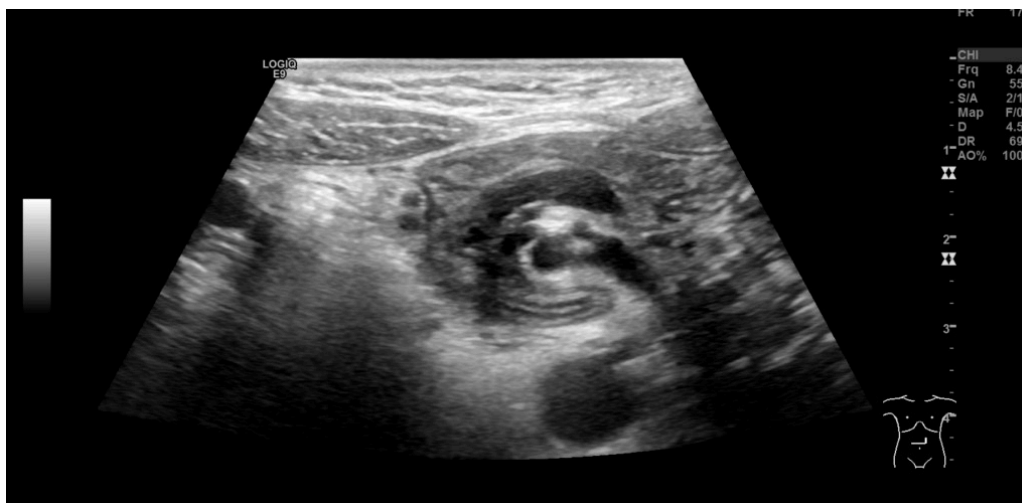
Figure 1 Ultrasound. Whirl sign involving vessels and the small intestine in the epigastrium.

The girl was kept under observation throughout the weekend. Her general condition had improved, and she had little abdominal pain and no episodes of vomiting. Her electrolyte levels quickly normalised following initiation of fluid therapy. On Monday morning, an ultrasound examination was performed by an experienced paediatric radiologist who confirmed the whirl sign (Figures 1 and 2) and who suspected concomitant volvulus (where a loop of intestine twists about its own axis). The diagnosis was confirmed by an upper gastrointestinal series, which showed passage of contrast to the proximal small intestine, but no further (Figure 3). The transition between the duodenum and small intestine was just to the left of the midline, caudal to the level of the duodenal bulb, which suggested malrotation with volvulus. The explanation for the patient's long-term symptoms had finally been found (Figure 4).