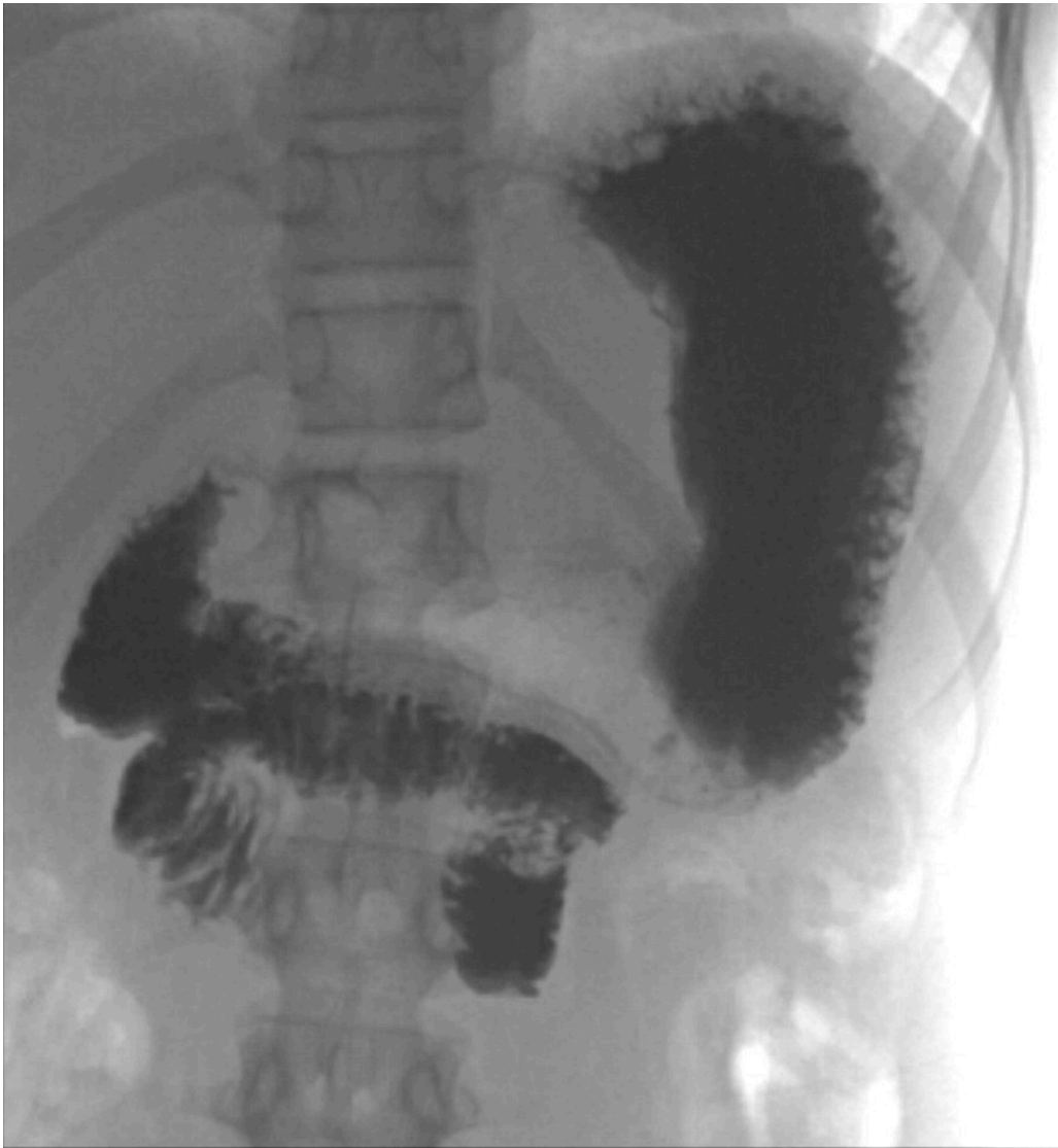
Figure 3 Upper gastrointestinal series (x-ray of oesophagus, stomach and duodenum). Contrast can be seen in the stomach and scattered throughout the duodenum, which has a typical 'corkscrew' appearance, with absence of contrast filling in the jejunum. The duodenum also has atypical positioning; normally the duodenum is further up and to the left of the midline than seen here.