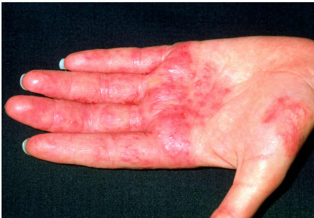
Figure 2 Contact eczema in a hairdresser. The skin is flaky and itchy and the upper layers are peeling away. The rash is caused either by an irritant reaction to a particular substance, by an allergic reaction or by a mixture of irritation and allergy.

Protein contact dermatitis is a subtype of allergic contact eczema. It is triggered by skin contact with a protein that initiates an IgE-mediated immunological response (type I) with subsequent development of eczema. The exact pathophysiological mechanism is unknown. The patient will report stinging, itching and burning seconds to minutes after exposure to the relevant protein. Protein contact dermatitis occurs in occupations involving wet work and frequent skin contact with proteins from food, animals and/or plants. Vulnerable occupational groups include chefs, fishermen, bakers, veterinarians and veterinary nurses (11) .