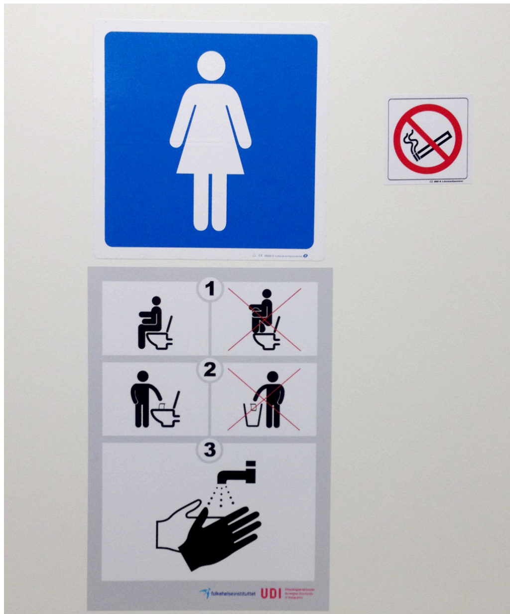
Figure 1 Information on toilet hygiene at the asylum reception centre in Sør-Varanger municipality

diarrhoea. The increasing flow of asylum seekers and scarcity of reception centres in other municipalities quickly exhausted the capacity of the 'Fjellhallen', and a number of hotels in Sør-Varanger were utilised.