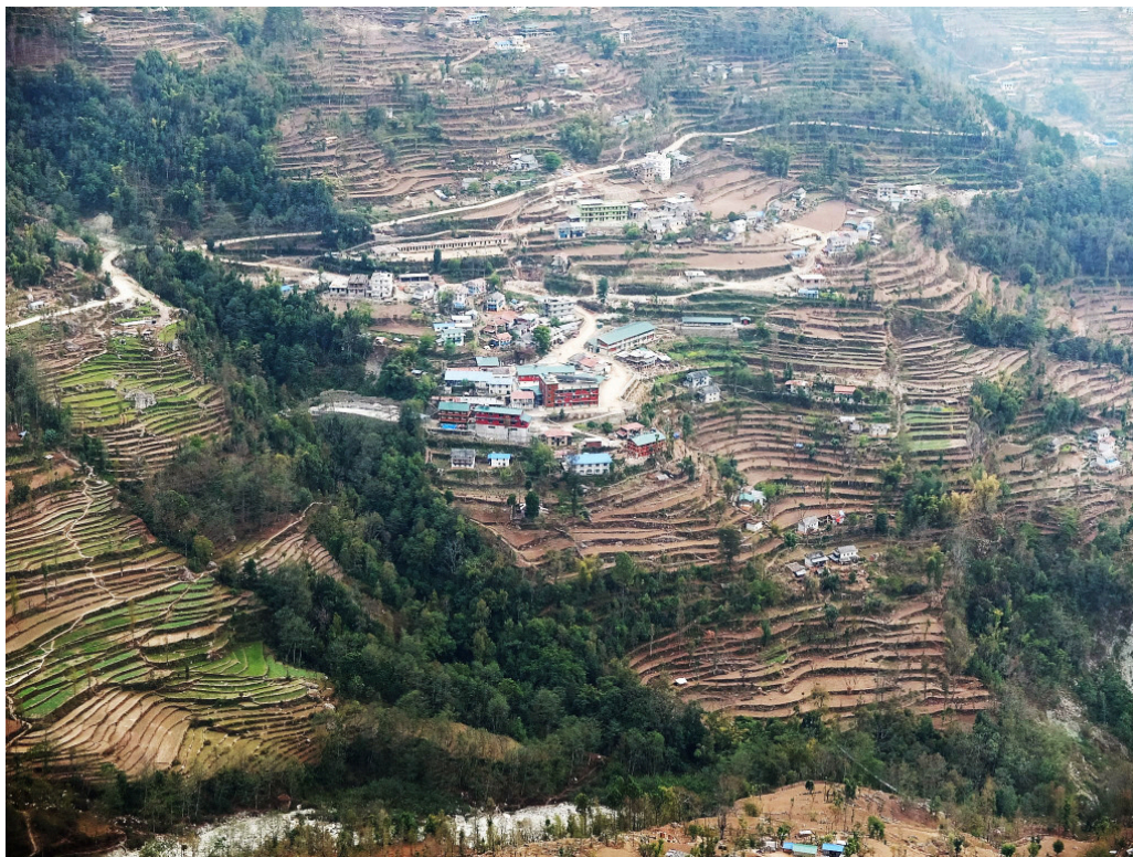
Figure 1 Okhaldhunga Community Hospital is situated on the side of the valley with terrace cultivation all around. Settlements here are scattered, but the hospital serves a population of more than 250 000 people.

The small Okhaldhunga Community Hospital in Eastern Nepal (6) is situated in rural surroundings with scattered settlements (Fig. 1). I have worked here for the last 14 years. The hospital now sees well over one thousand births per year, but we still see disastrous effects resulting from pregnant women failing to obtain qualified assistance in time. Much of the problem has been that they have relied on a home birth. Heavy postpartum haemorrhage alone causes 25–30 % of maternal deaths here in Nepal (7), about the same as in most poor countries in Asia and Africa (8). In a population of more than 250 000 people in Okhaldhunga District, this alone represents a number of deaths annually. Obstructed labour due to mechanical anomalies or an undiagnosed abnormal fetal position is also common. For those who fail to reach the hospital in time, this may lead to ischaemic injury with lifelong sequelae in the child or fetal death, possibly also uterine rupture and risk to the mother's life. This brings us to the heart of the matter: In a part of the world where maternal mortality is high and transport is slow and costly, how can we ensure that women in labour reach the hospital in time?