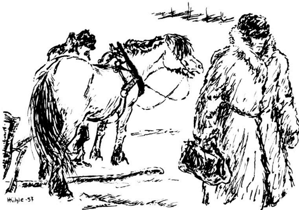
Figure 1 Vesleblakken and the doctor. Illustration by Harald Kihle (1905–97) from 1957. Figure from Thorbjørn Egner's textbook (4, page 155). Illustration © Harald Kihle/BONO

The story is well known. It was reproduced in the school textbooks edited by Nordahl Rolfsen (1848–1928) and Thorbjørn Egner (1912–1990) throughout most of the 20th century (Figure 1) (3–5) . The story thus became part of the Norwegian literary canon. The above excerpt is taken from Egner's adapted version (4) . It was subsequently omitted from the school textbooks, and the young generation of today is less familiar with the story of Vesleblakken.