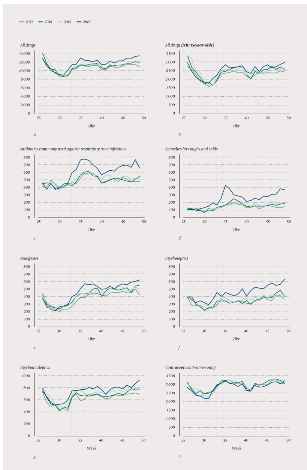
Figure 3 Dispensing rate for prescription drugs per week in the years 2013 – 16 (age group 16 – 18 years unless otherwise specified). a) All drugs. b) All drugs in the age group 15 years. c) Antibiotics commonly used against respiratory tract infections. d) Remedies for coughs and colds. e) Analgesics. f) Psycholeptics. f) Psychoanaleptics. h) Contraceptives. The dotted line marks week 33, normally the week when the school year starts (mid-August).

The dispensing rate for drugs in the analgesics group (ATC code N02) was also higher in the autumn of 2016 when compared to previous years (Table 3, Figure 3e), and this also applied to psycholeptics (ATC code N05) (Table 3, Figure 3f). As regards the psychoanaleptics group (ATC code N06), an increase may seem