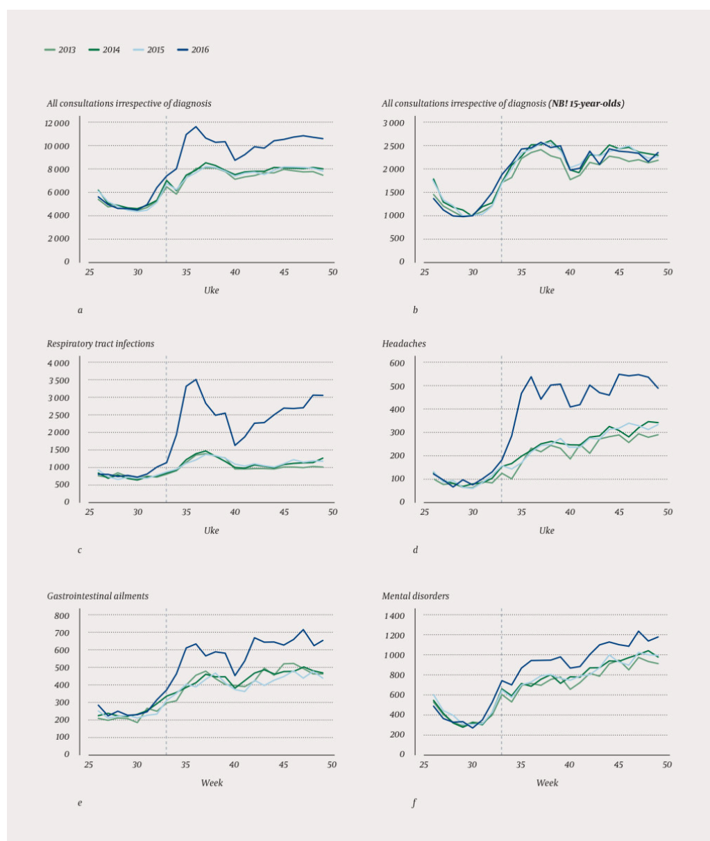
Figure 1 Number of consultations in general practice per week in the years 2013 – 16 (age group 16 – 18 years unless otherwise specified). a) All consultations. b) All consultations in the age group 15 years. c) Respiratory tract infections. d) Headaches. e) Gastrointestinal ailments. f) Mental disorders. The dotted line marks week 33, generally the week when the school year starts (mid-August).

Respiratory tract infections constituted the most frequently occurring diagnosis group (Table 3, Figure 1c). During the period 2013 – 15, the number of consultations for respiratory tract infections remained consistently below 1 500 per week, while a significant increase was seen in 2016, with 3 492 as the highest number recorded in week 36. The consultation rate for respiratory tract infections was 23.2 per 100 persons in the autumn of 2016, compared to 10.5 per 100 in the preceding year, equal to more than a doubling (IRR 2.21, 95 % CI 2.17 – 2.25), see Table 3.