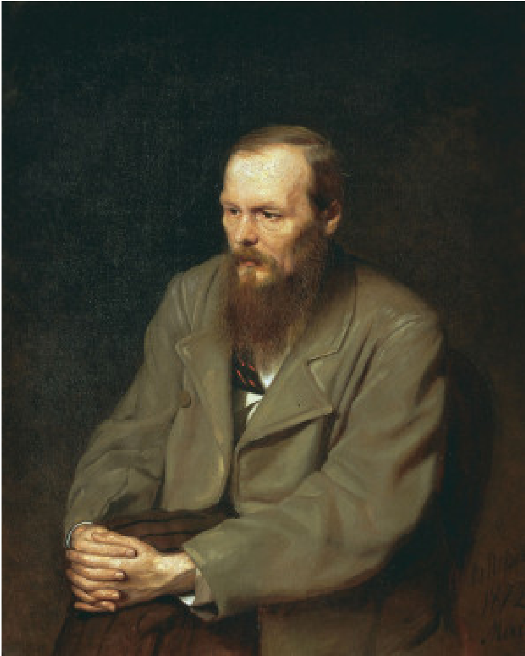
Figure 2 Fyodor M. Dostoyevsky (1821–81) suffered from epilepsy and the disease was a topic in many of his books. Portrait by Vasily Perov, 1872.

never diagnosed during his lifetime, and the diagnosis is based on his diaries and novels, as well as statements from general practitioners who examined him (9) .